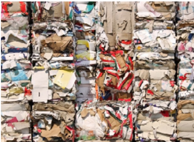
PAPER / CARBOARD