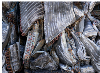
CU / AL RADIATORS