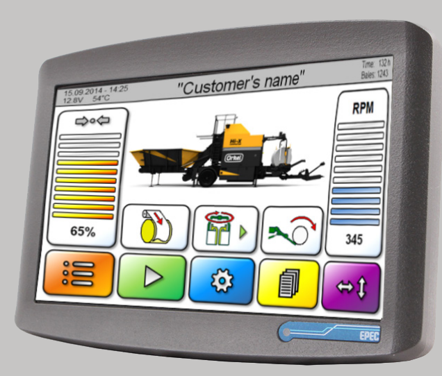
Orkel touch control system