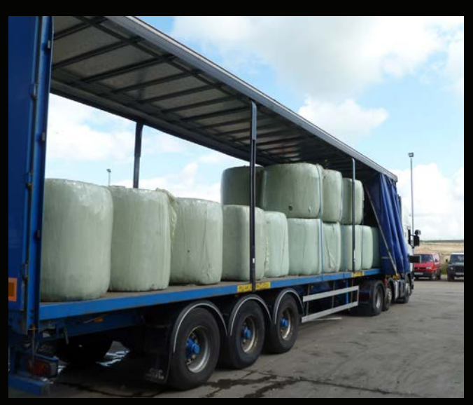
Orkel RDF bales ready for transport

No oxygen is left in the material, no oxygen gets in.