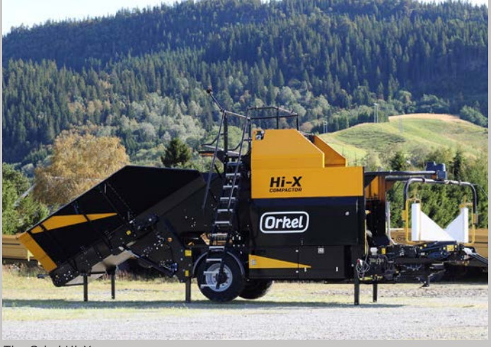
The Orkel Hi-X evo

The Hi-X compactor is an improvement of our best compactors. The unique design of technical details like auto greasing of bushings and auto oiling of chains, makes the compactor exeptionally durable. The results are low maintenance and life cycle costs, which gives major advantages for your production.